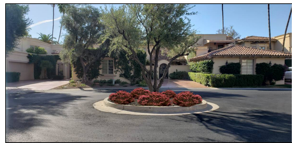
IMAGERY - CIRCLE OLIVE TREE PLANTER